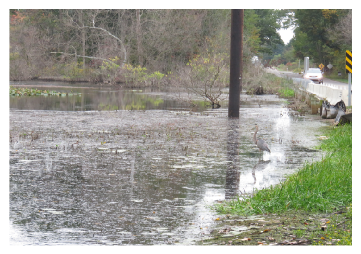
11055 8<sup>TH</sup> ST. NEAR U AVE. WITH BARRICADES BY COUNTY ROAD COMMISSION