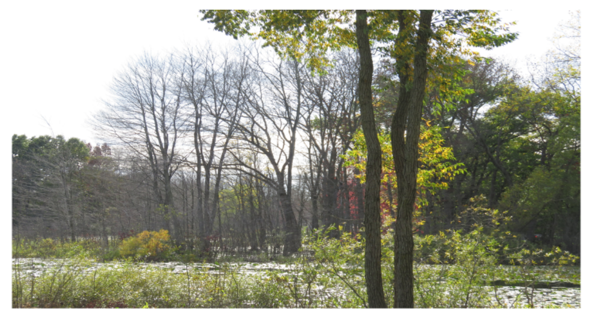
CORNER 3<sup>RD</sup> ST. & P AVE.

Other wetlands in Texas Township that have been impacted by flooding are shown on the following pages. The stress on these wetlands is evident in these photos, as well as showing large trees being impacted.