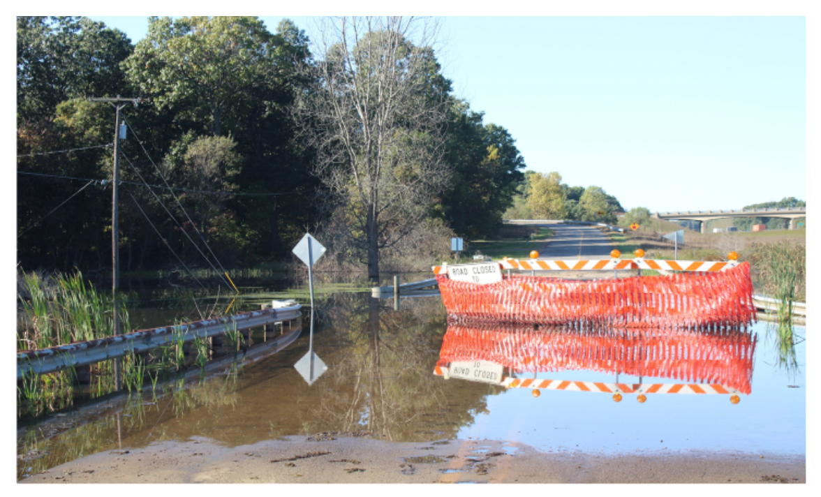
O AVE. CLOSED DUE TO HIGH WATER