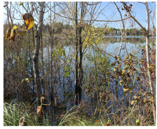
TREASURE ISLAND CAUSWAY